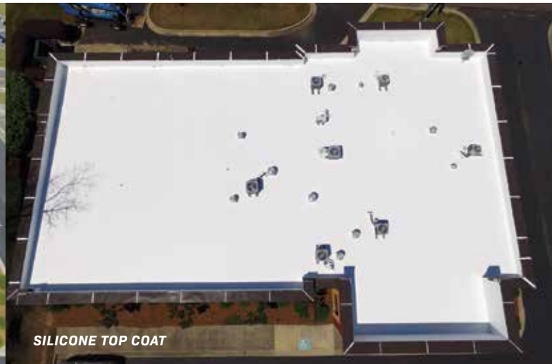
SILICONE TOP COAT

THE LEADER IN FLUID-APPLIED ROOF RESTORATION