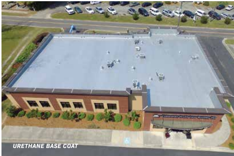
URETHANE BASE COAT